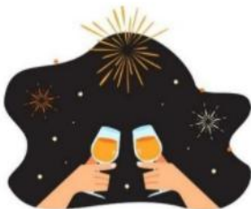
Happy New Year's Eve

Anticipation Mass, Saturday at 5:00 P.M., Sunday at 9:30 A.M. & 6:00 P.M. Full Christmas Choir at 9:30 A.M. Mass (Music begins at 9:15 A.M.)