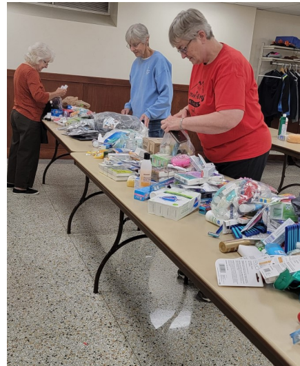
Ladies Club at work and play: Visit to National Shrine of St. Therese in Darien, IL Bedding Plant Sale Wine and Canvas Painting Sorting toiletries for the unhoused